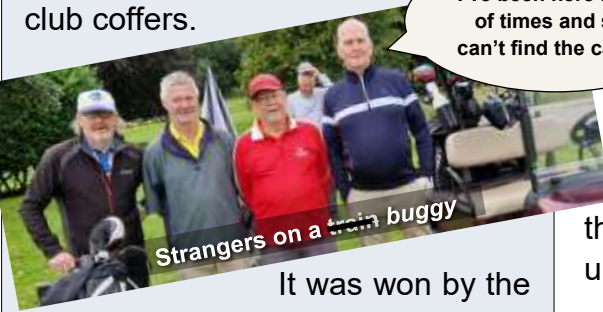
Strangers on a golf buggy

I've been here loads of times and still can't find the castle.